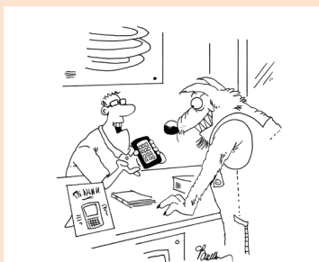
"Say you want to huff and puff and blow a house in...there's an app for that."

Whole-grain foods include cereal, oatmeal, grits and whole-wheat bread.