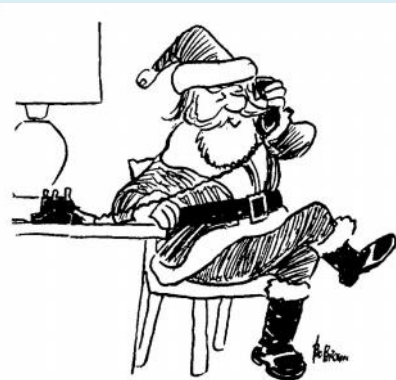
"Acme Roofing? I have some good leads for you."

If a collision is inevitable, brake but don't swerve to avoid it. Your risk of injury is much greater if you hit oncoming traffic or crash into a tree.